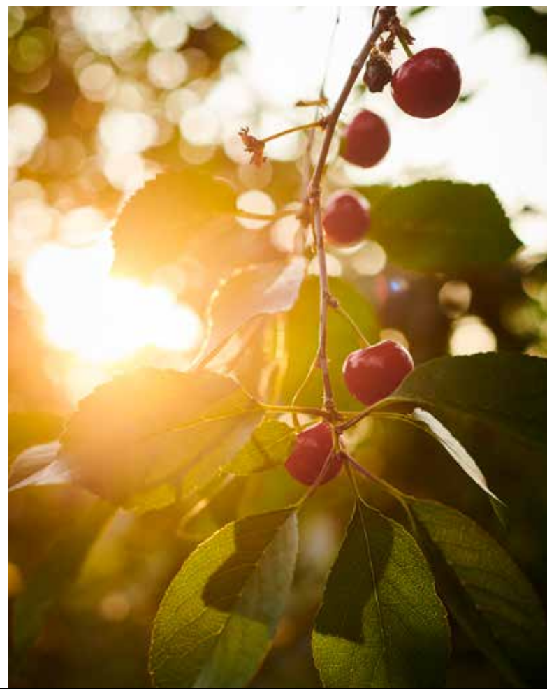
chilled cherry soup with teekay tkktkt