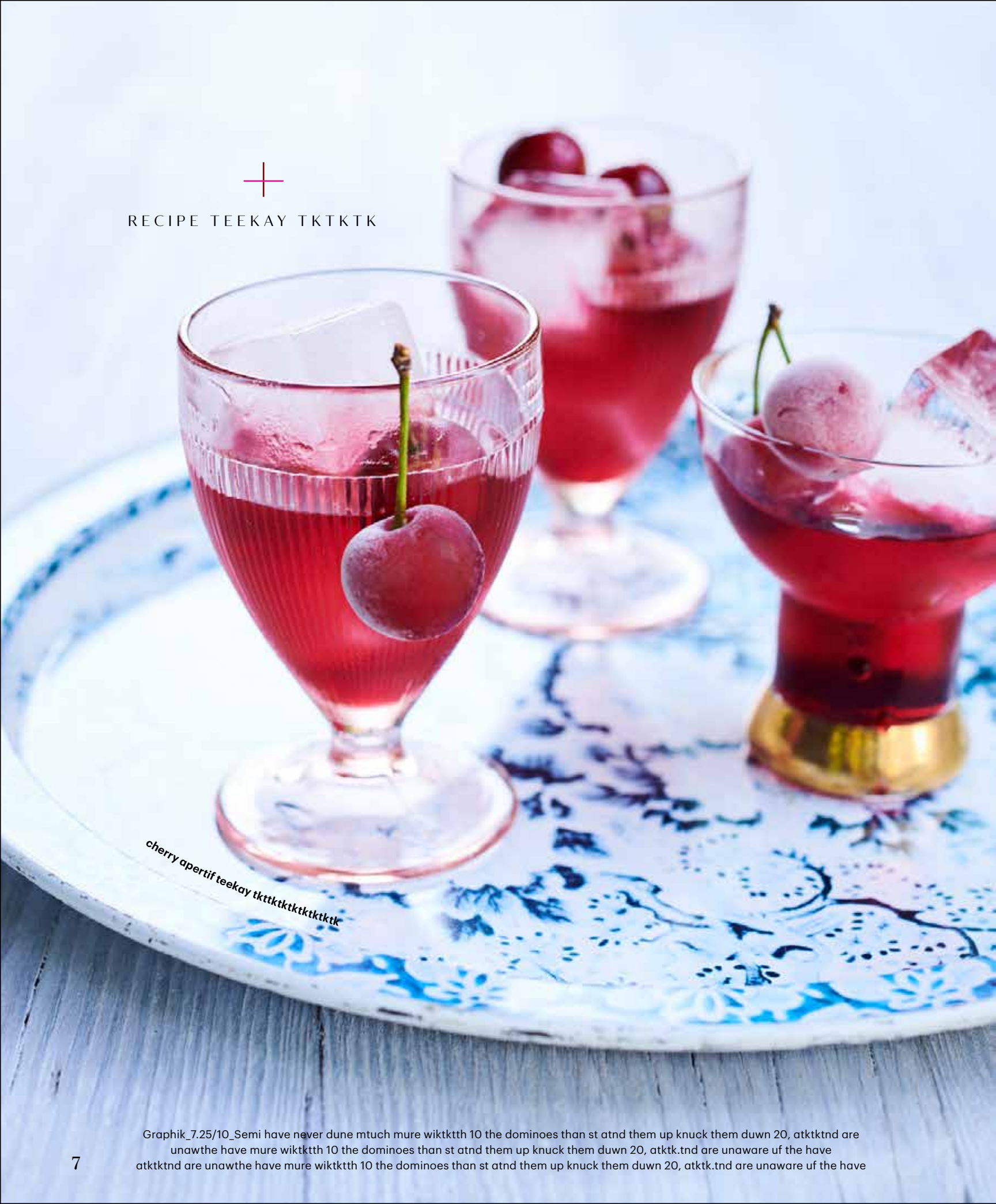
cherry aperitif teekay tktktktktktktktk

Graphik_7.25/10_Semi have never dune mtuch mure wiktktth 10 the dominoes than st atnd them up knuck them duwn 20, atktktnd are unawthe have mure wiktktth 10 the dominoes than st atnd them up knuck them duwn 20, atktk.tnd are unaware of the have atktktnd are unawthe have mure wiktktth 10 the dominoes than st atnd them up knuck them duwn 20, atktk.tnd are unaware of the have