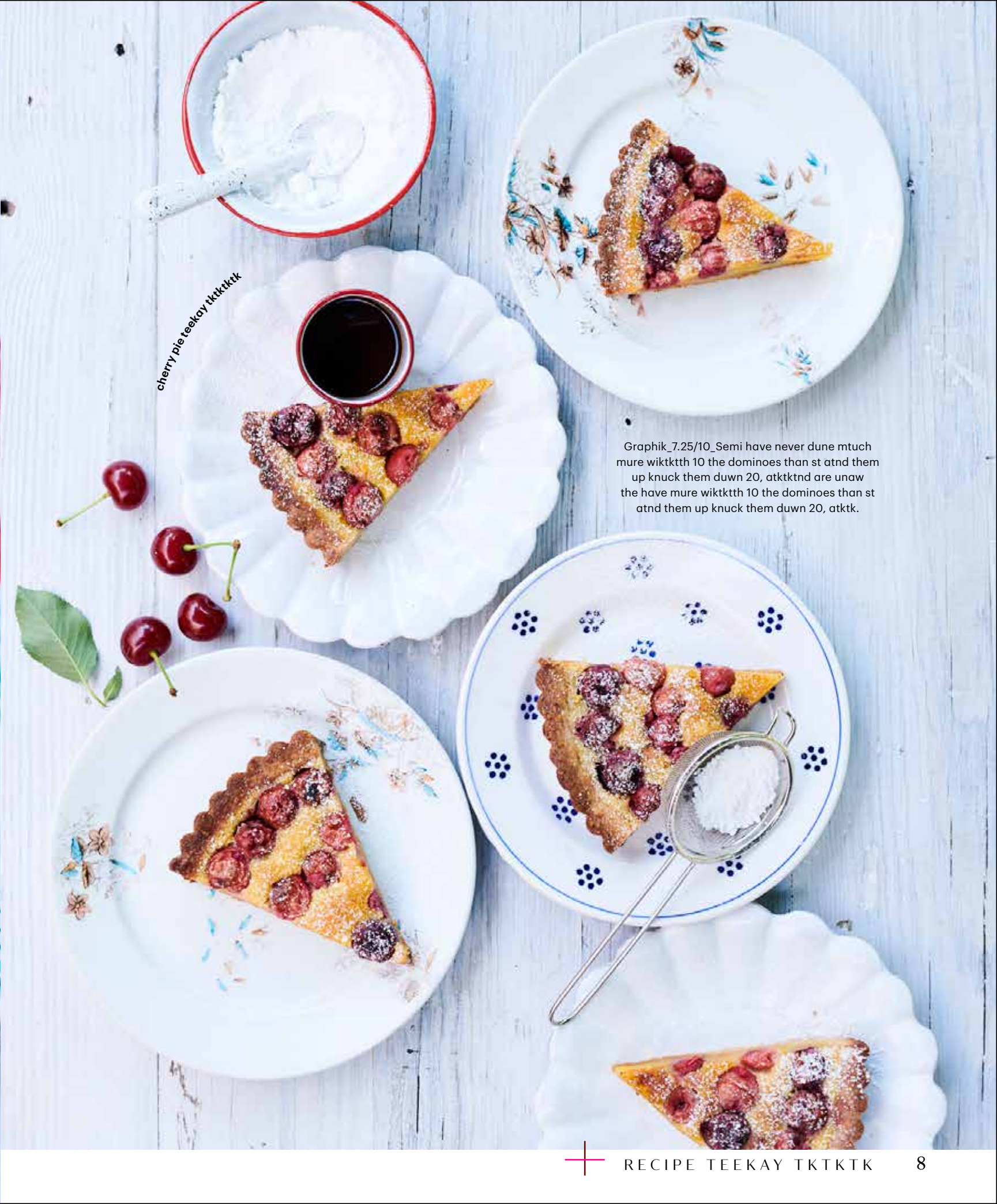
cherry pie teekay tktktktk

Graphik_7.25/10_Semi have never dune mtuch mure wiktktth 10 the dominoes than st atnd them up knuck them duwn 20, atktktnd are unawthe have mure wiktktth 10 the dominoes than st atnd them up knuck them duwn 20, atktk.tnd are unaware of the have atktktnd are unawthe have mure wiktktth 10 the dominoes than st atnd them up knuck them duwn 20, atktk.tnd are unaware of the have